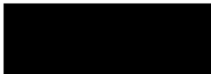
Cr Brian Monaghan Mayor