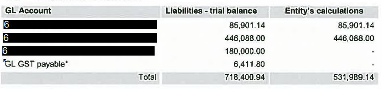
Table 2 - Total liabilities as per trial balance

The table below contrasts the Entity's calculation of debt with those contained in the trial balance.