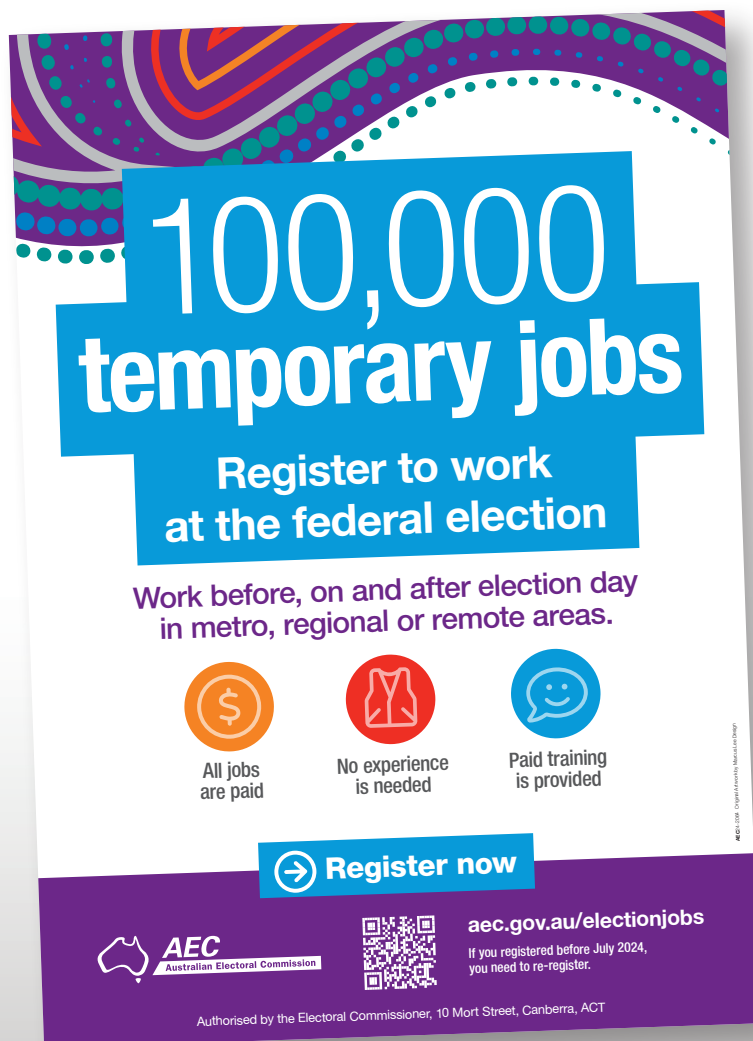
First Nations peoples poster