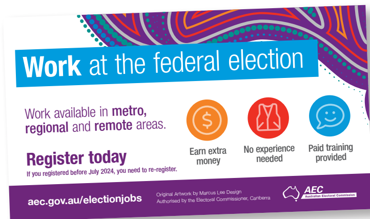
First Nations peoples Facebook tile