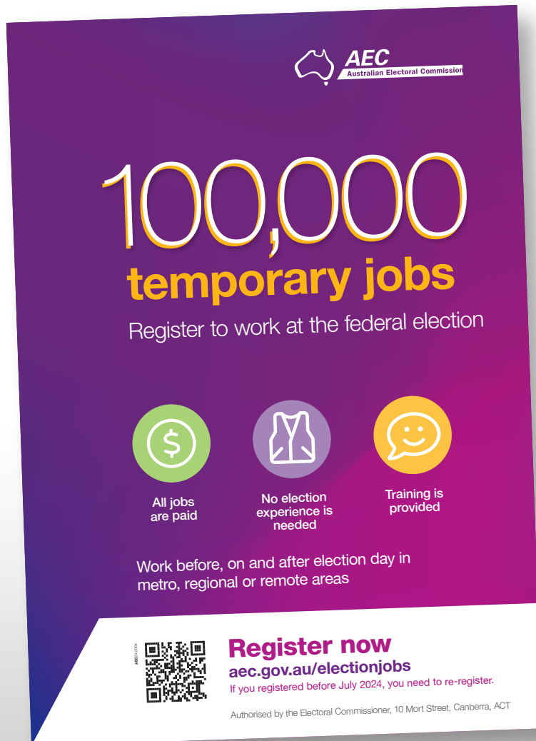
General population poster