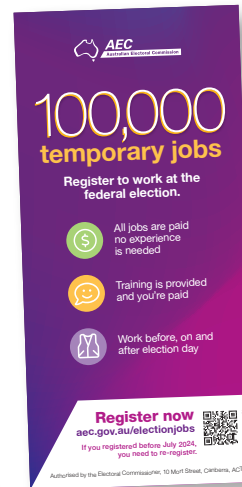
General population DL flyer