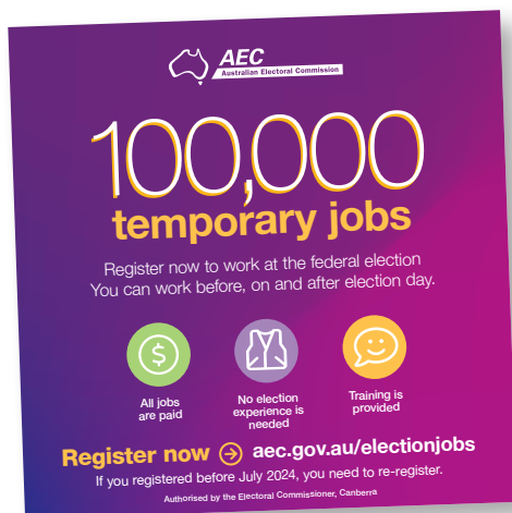
General population social tile