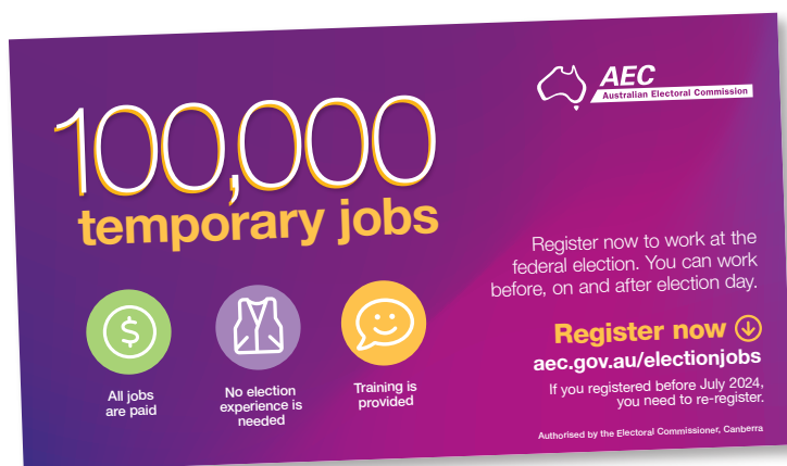
General population Facebook tile