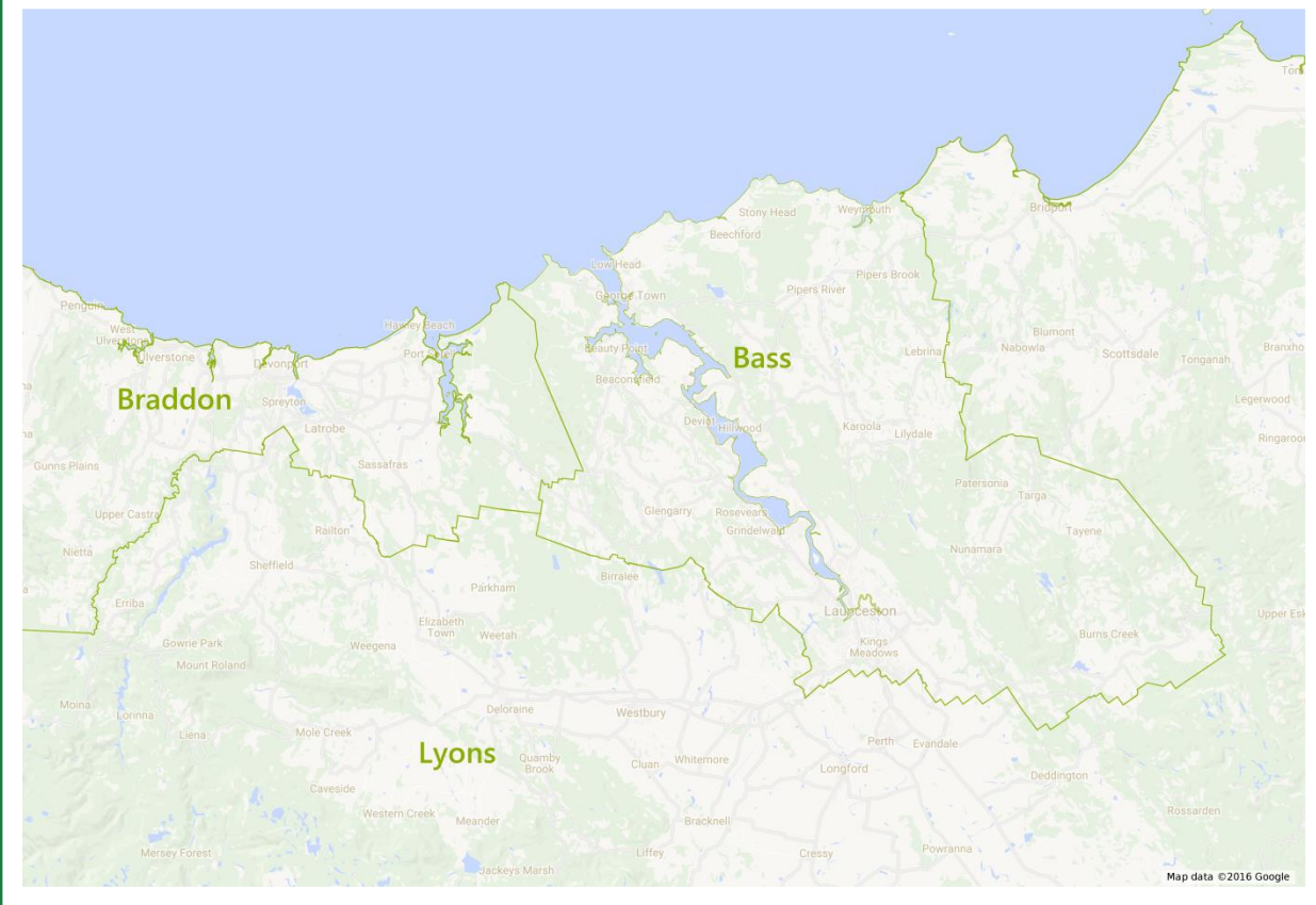
Launceston and Devonport area