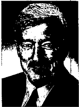
Peter Andren M.P. Federal Member for Calare