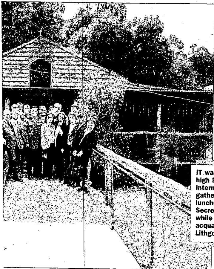
IT was indeed a high level international gathering that lunched at Secret Creek while becoming acquainted with Lithgow