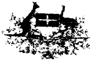
Queen Elizabeth II Head of State