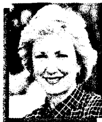
Trish Worth FEDERAL MEMBER FOR ADELAIDE

93 FROME STREET (Corner of Grenfell Street) ADELAIDE SA 5000