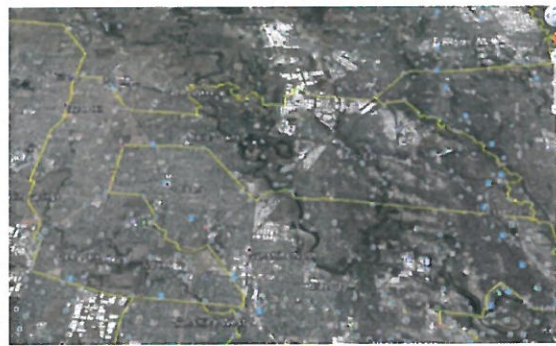
The original 'gerry-mander' seat