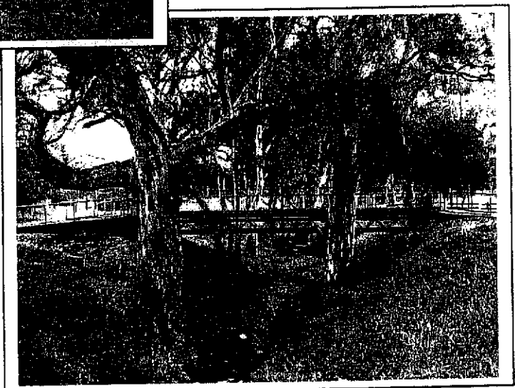
West of Kings Road