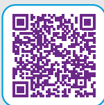
Sample ballot paper

You can practise voting at aec.gov.au/practise